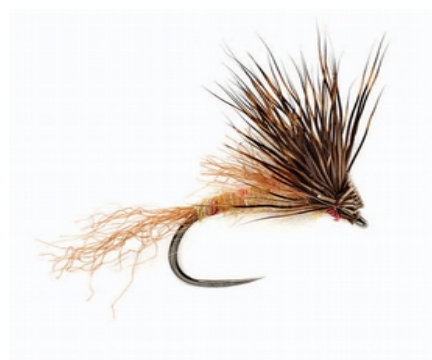
Rinkers CDC Wonder Bug from Orvis