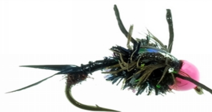
Egg Sucking Stone from Alaska Fly Fishing Goods