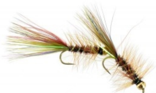
T B Doublemint Olive from CatchFlyFish.com